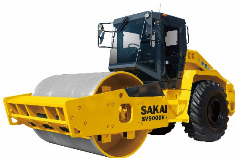
VIBRATORY SINGLE DRUM ROLLER SV900DV 20,030Kg (44,460Lb)