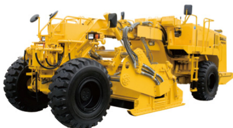
ROAD RECLAIMER PM550-2 22,580Kg (49,780Lb)