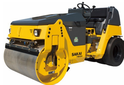
VIBRATORY DOUBLE DRUM ROLLER TW504 3,620Kg (7,980Lb)