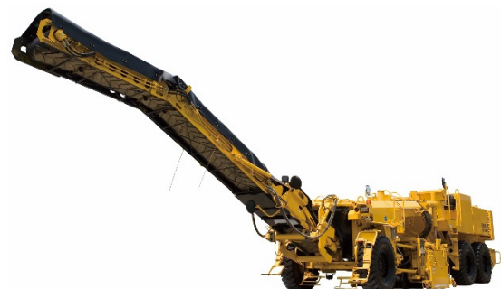
ROAD PLANER ER552F-2 28,170Kg (62,105Lb)