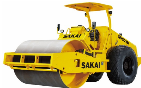
VIBRATORY SINGLE DRUM ROLLER SV521D 10,325Kg (22,765Lb)