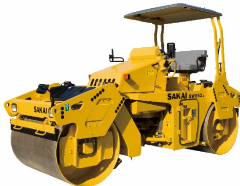
VIBRATORY DOUBLE DRUM ROLLER SW652H-1K/SW654H 8,080Kg (17,815Lb)