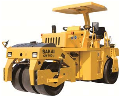
VIBRATORY PNEUMATIC TIRED ROLLER GW750-2 9,040Kg (19,930Lb)