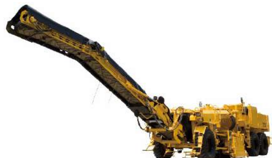
ROAD PLANER ER552F 28,170Kg (62,105Lb)