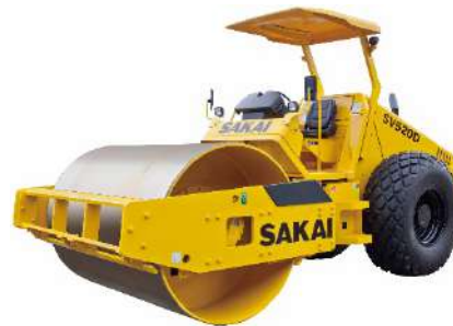
VIBRATORY SINGLE DRUM ROLLER SV520D 10,450Kg (23,040Lb)