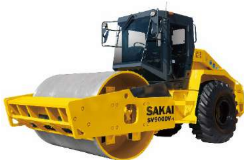
VIBRATORY SINGLE DRUM ROLLER SV900DV 20,030Kg (44,460Lb)

SAKAI HEAVY INDUSTRIES, LTD. International Business Headquarters TELEPHONE: +81-3-3431-9971 FACSIMILE: +81-3-3436-6212 URL: https://www.sakainet.co.jp/en/