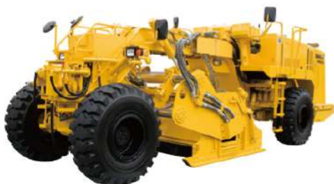
ROAD RECLAIMER PM550 22,580Kg (49,780Lb)