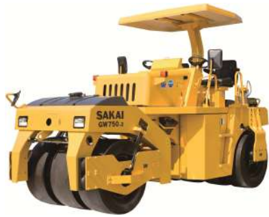
VIBRATORY PNEUMATIC TIRED ROLLER GW750 9,040Kg (19,930Lb)