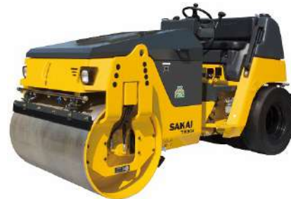
VIBRATORY DOUBLE DRUM ROLLER TW504 3,620Kg (7,980Lb)