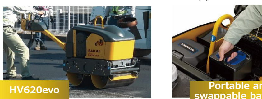
Reduce CO<sub>2</sub> emissions from construction equipment

* A system initiated by the Ministry of Land. Infrastructure. Transport and Tourism for the purpose of promoting the widespread use of GX (green transformation) construction machinery contributing to carbon neutrality, reducing CO<sub>2</sub> emissions from construction operations, and contributing to global environmental conservation. This is eligible for subsidies from the Ministry of the Environment.