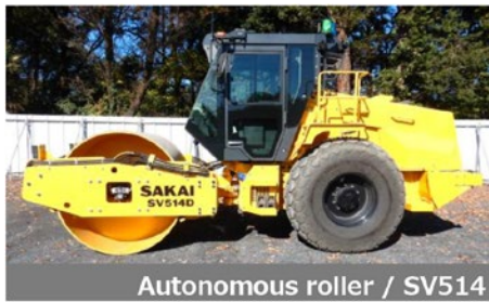
Autonomous roller / SV514