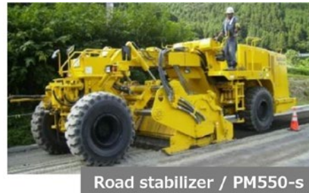
Road stabilizer / PM550-s